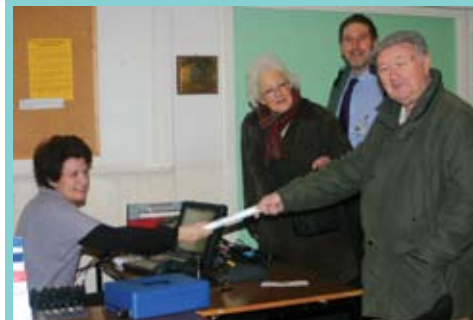
Above: The first customer is served at the opening of the Chetnole post office outreach service in January

Villagers in Chetnole, West Dorset, now have a weekly post office outreach service, run from the village hall. And when they have taken advantage of services such as getting post weighed, paying in cash or drawing out pensions, they can stay for tea and coffee served by volunteers. The service was opened in January, with the help of Dorset Community Action, following the closure of the village shop a year earlier.